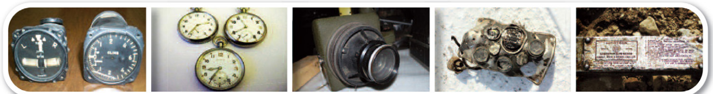
Radium Luminous Dials