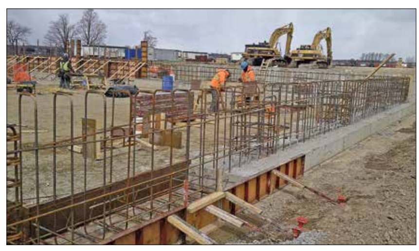
Foundation wall construction of new waste water treatment plant