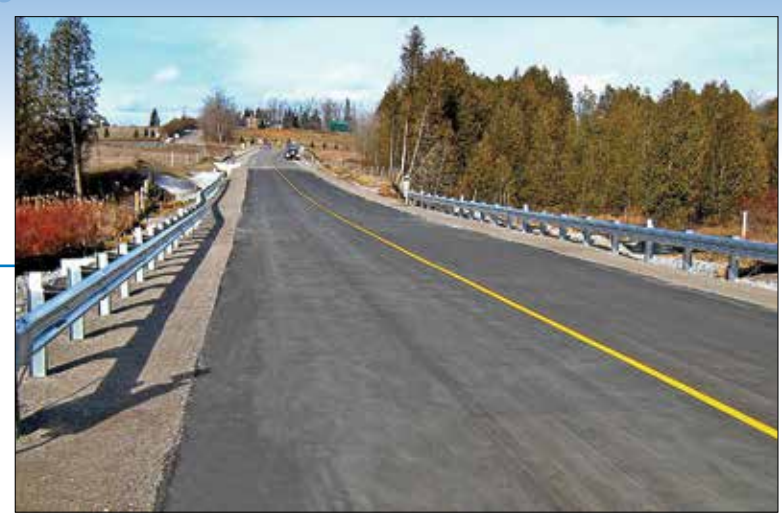
Upgraded Elliott Road

The reconstruction of Elliott Road and resurfacing of a section of Newtonville Road and Concession Road 1 were completed in December. The clean construction material transportation route was approved as part of the Environmental Assessment for the Port Granby Project to minimize project effects on the community. Use of this route avoids disruption to Lakeshore Road, an important recreational route through the hamlet. The resurfacing will